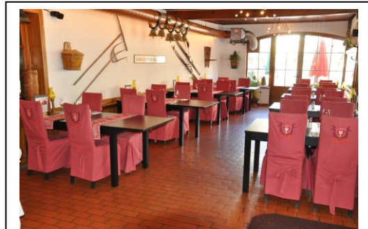
Chässtübli (Cheese Lounge) Banquet up to 35 Pax/ Receptions for 45 Pax