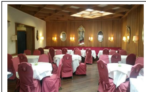
Restaurant Banquet up to 35 Pax/ Receptions for 45 Pax