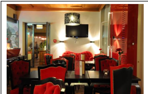
Bar: Banquet up to 20 Pax/ Receptions for 30 Pax

We are thrilled that you are interested in our Hotel and Restaurant for your special event. Our establishment, centrally located on the Bahnhofstrasse in Interlaken, along with our various spaces, offers a plethora of arrangement options for your choosing.